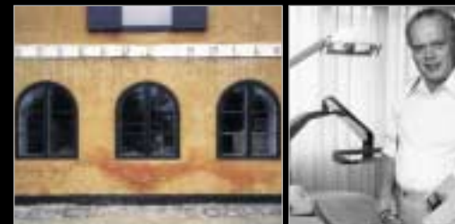
Usserød Mølle, anno 1760. Headquarters of XO CARE A/S

XO CARE A/S is the new name of Flex Dental A/S. The company has served the dental team since 1951. XO CARE is "Dental Care Made Extraordinary". We believe that well-designed quality products are the solution to the needs of the dental team. Together with our partners we strive to be the best to advise, educate and service you - before, during and after the sale. We are always eager to listen and cooperate.